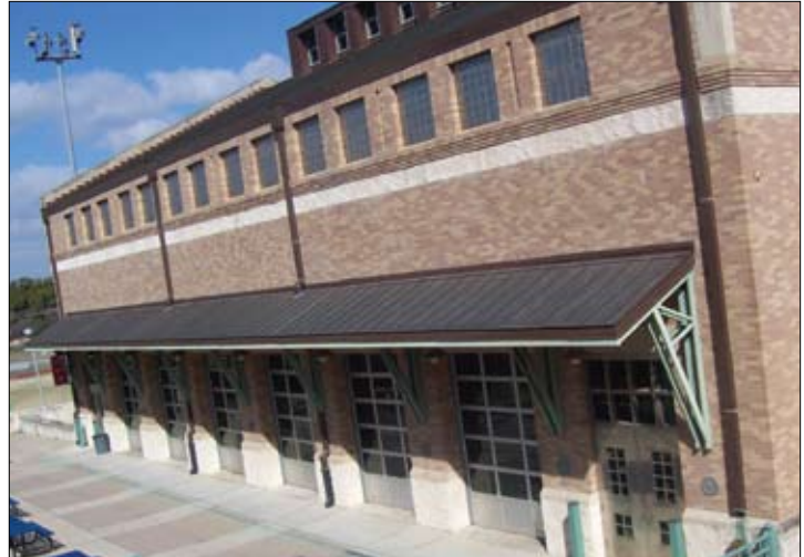
Leroy Colombo Swim Center at TSD

The Galveston City Council, on May 22, voted to add to 57th St. the name “Leroy Colombo’s View,” from Seawall Blvd. to Maco St. Other projects include a grave marker for Colombo’s currently unmarked resting place, and traveling exhibits.