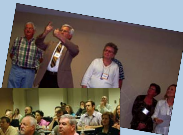
Bottom: NLTC participants at a breakout session.