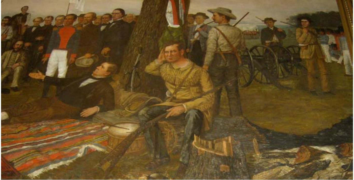
"The Surrender of Santa Anna" by William H. Huddle, located in the south entrance of the Texas Capitol. Injured General Sam Houston laying near Deaf Smith